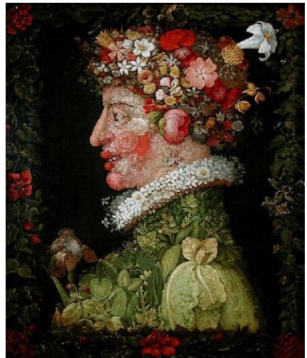
Le printemps (Arcimboldo - 16 ème )